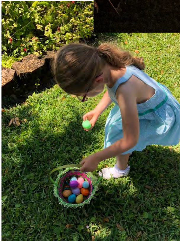
Easter Egg Hunt after 10 AM service.