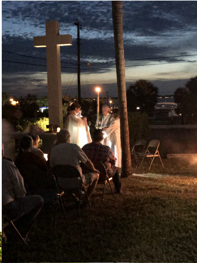
Early morning Sunrise Service