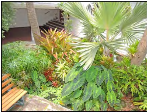
The Fish Pond