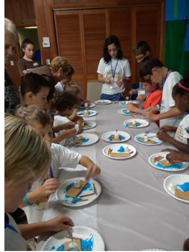
Right -everyday each group makes a tropical snack.