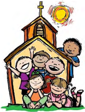
This Photo by Unknown